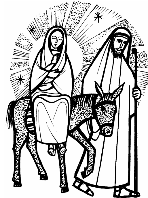
The Flight into Egypt