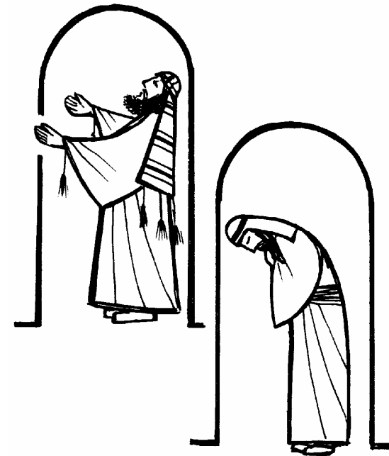
The Pharisee and the Tax Collector